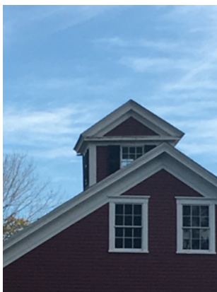
Two Acton Center examples of barn cupolas