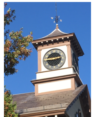
Is the 1860s Acton Town Hall bell tower technically a cupola?