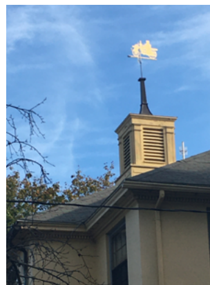
Acton Central Fire Station, circa 1952