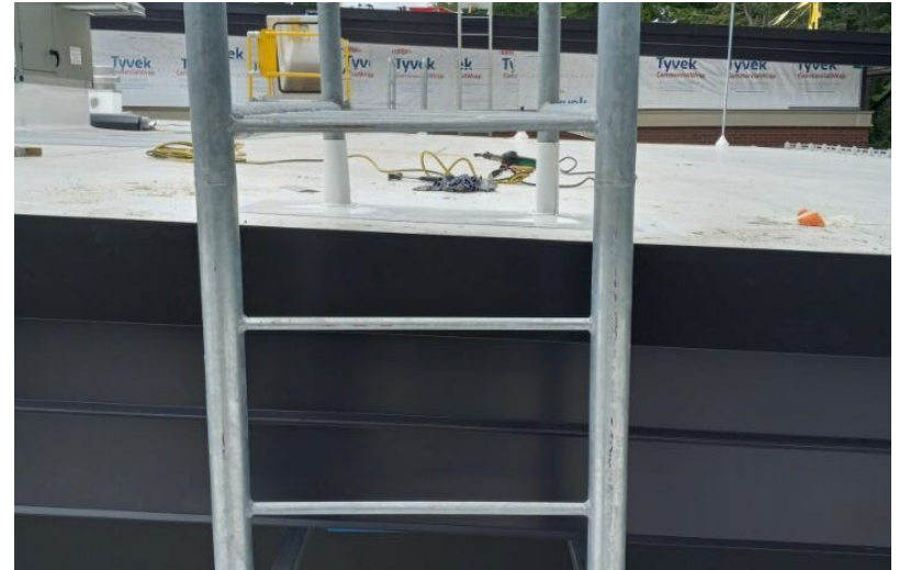
More roof ladder installation