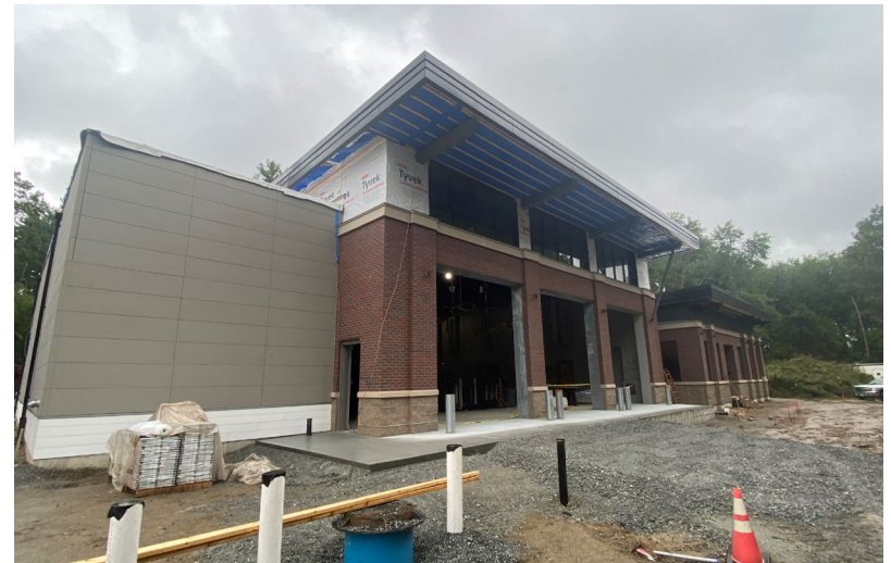
Overview of building from southwest