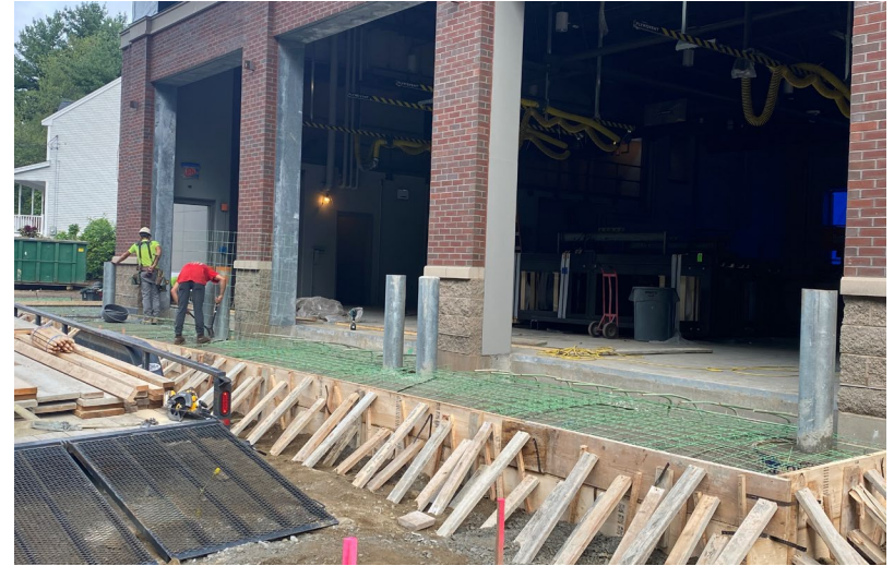
Preparation for concrete pour