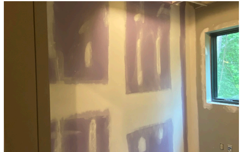
Installation of dry wall continued