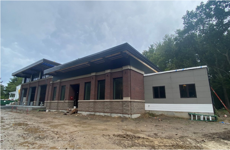
Overview of building from southeast