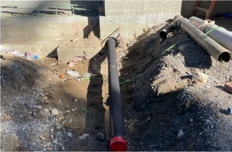
Pipe bend has been resolved