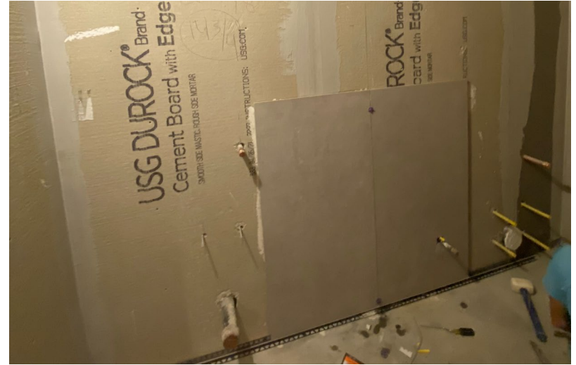
Tile installation in bathroom