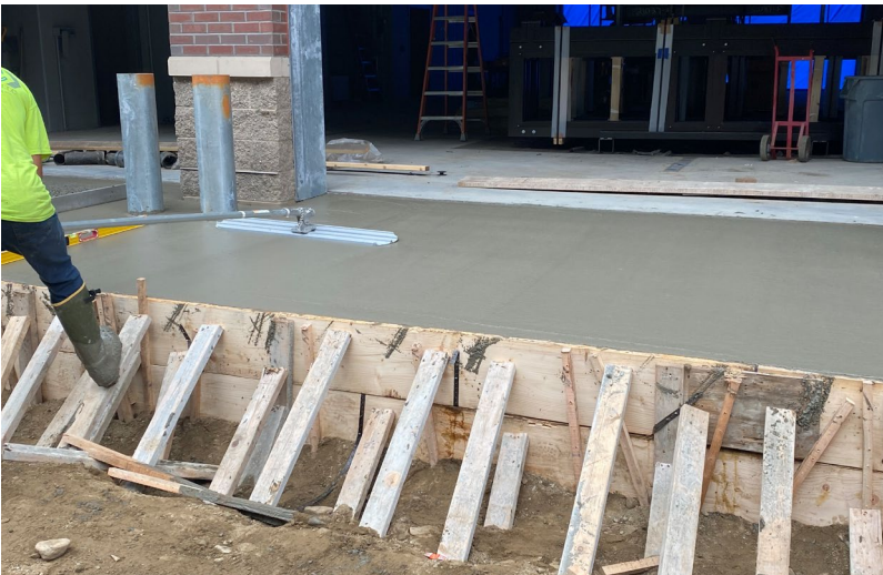
Pour the concrete apron