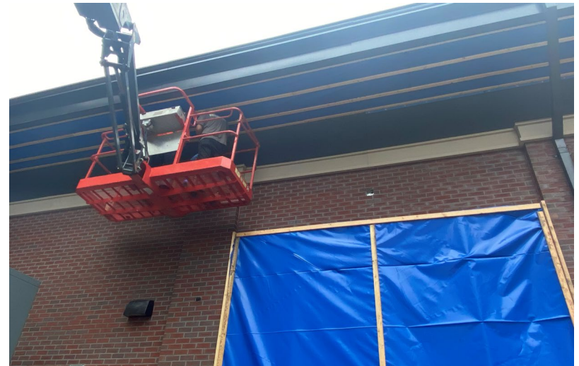
More Nichiha siding