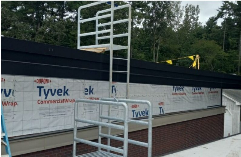
Roof ladders installation