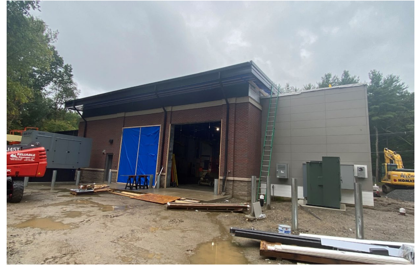
Overview of building from northwest