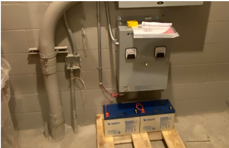
Installation charger and batteries in electrical room