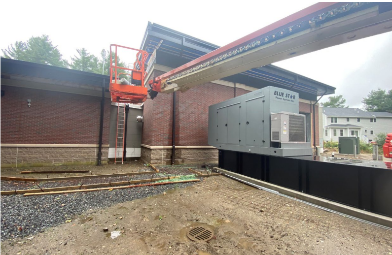
Overview of building from northeast