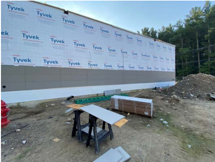
Overview of west side of building