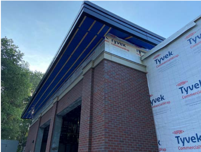
Typical vapor retarder installed at exterior soffits