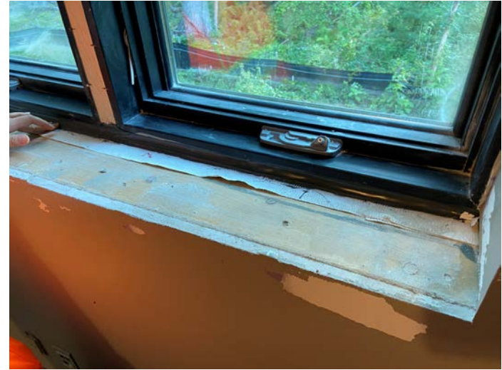
Interior joint sealant installed at bunk room windows