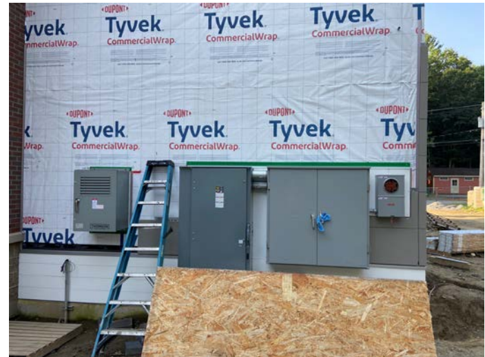
Exterior electrical cabinets and meter