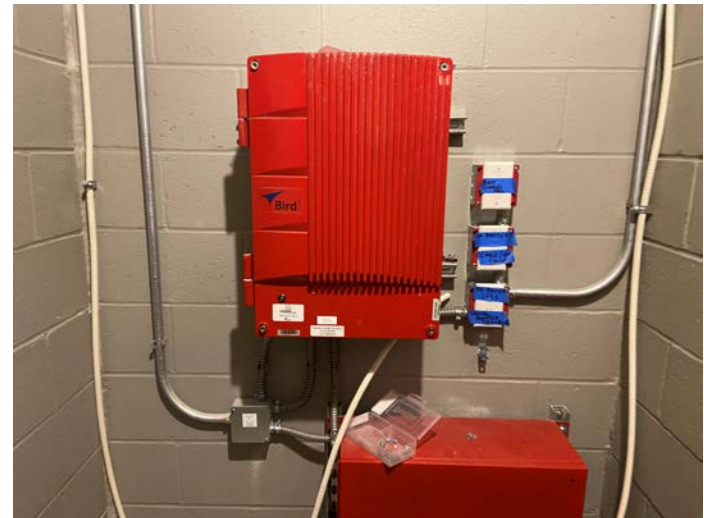
BDA equipment installation in emergency electrical room