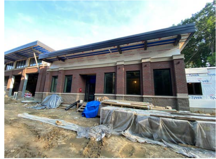
Overview of main entrance