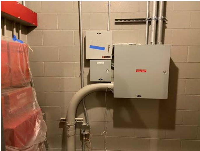
Fire alarm equipment installation in emergency electrical room