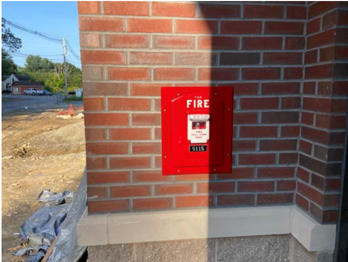
Fire alarm master box at main entrance