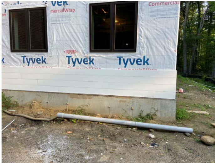
PVC siding on southeast side of building