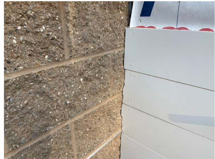
Typical PVC to cast stone interface