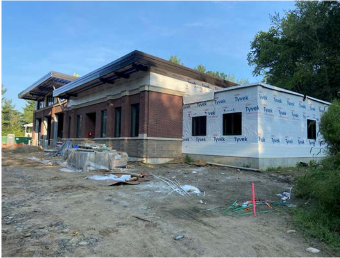
Overview of building from southeast