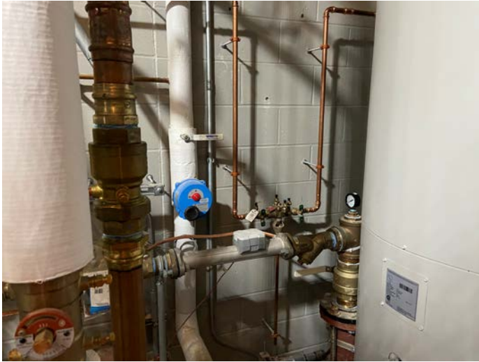
Backflow preventer in mechanical room relocated per Water District