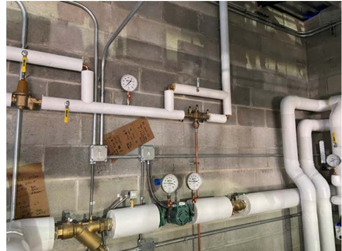
Backflow preventer at mechanical mezzanine to be relocated and bypass removed