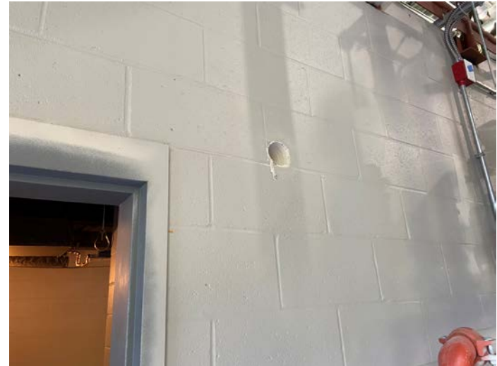
Hole cored through CMU wall for dirty laundry room HVAC condensate line