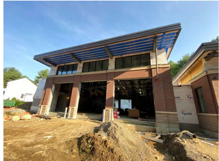
Overview of apparatus bay south side