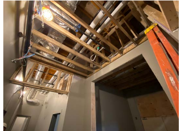
Soffit installation at vestibule. Pipes/electrical to be re-located as necessary to go above ceiling.