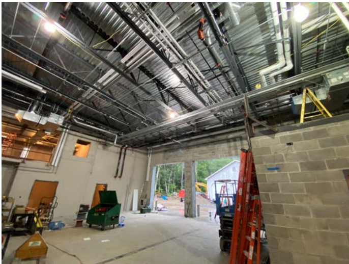
South side of apparatus bay