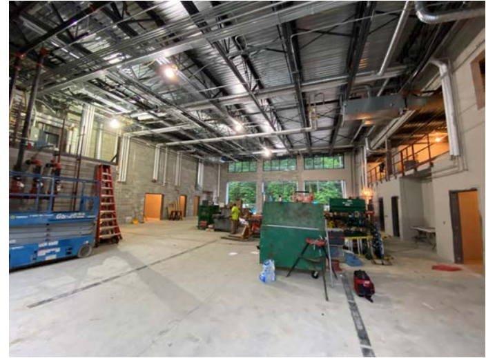
Overview of apparatus bay from north