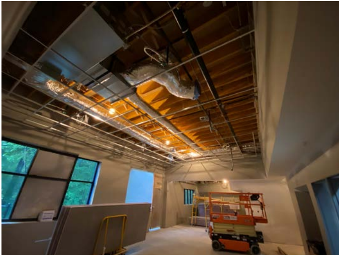
Acoustical ceiling grid installation in day room