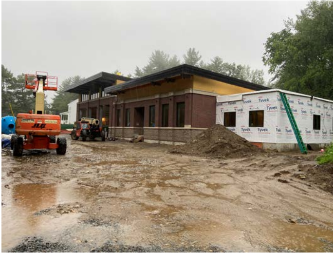
Overview of building from southeast