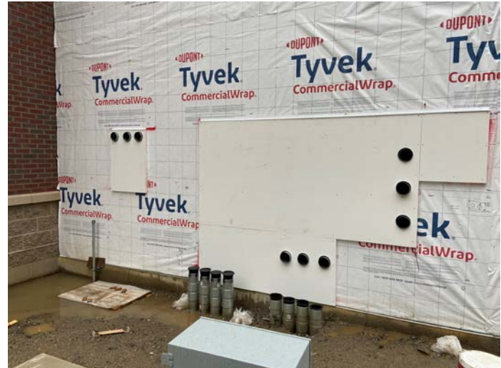
Backerboards installed for exterior electrical panels/meter