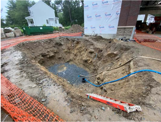
GSI Tank excavation