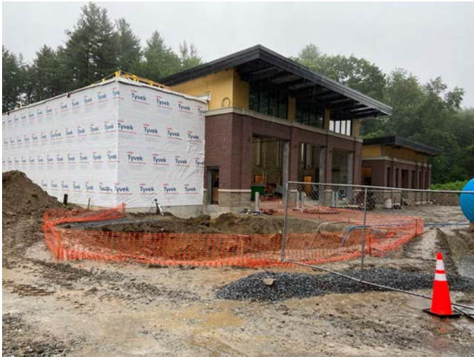
Overview of building from southwest