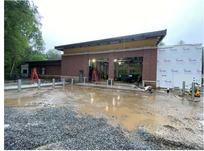
Overview of building from north