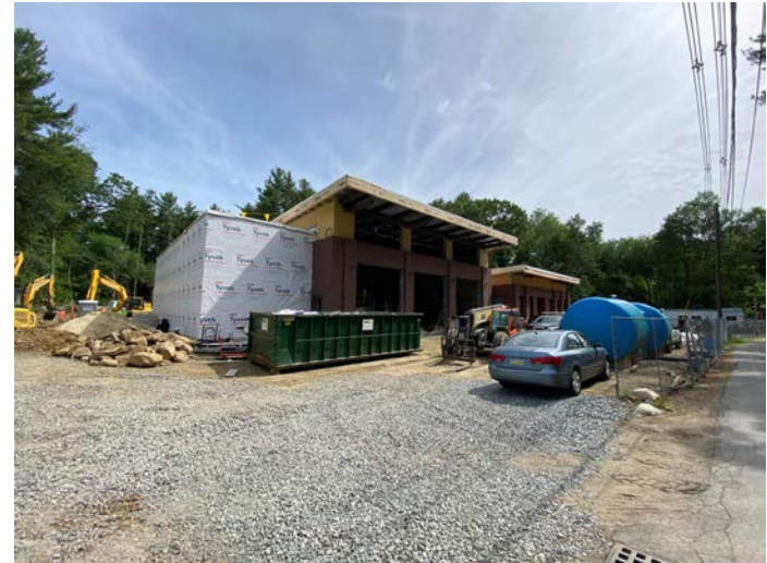
Overview of building from southwest