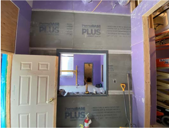
Installation of tile backerboard and drywall at vestibule