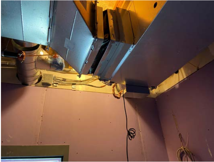
Installed condensate pump in locker room