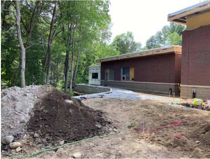
Northeast side of building