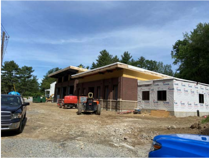
Overview of building from southeast