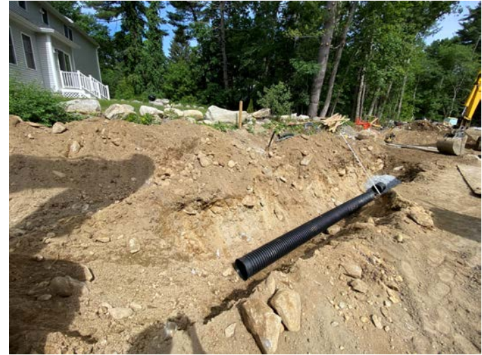
Installation of drain line from CB#1 to WQU#3