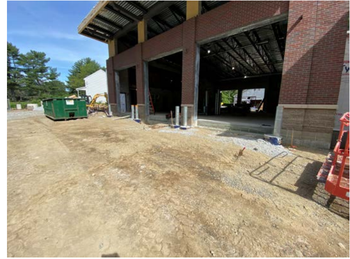
Footings for bollards installed on south side of building