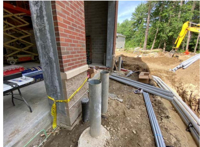
Footings for bollards installed on north side of building