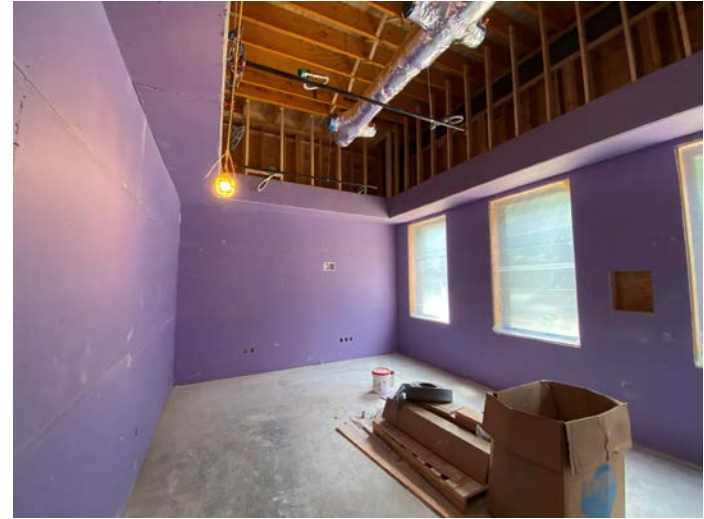
Drywall installation in conference area