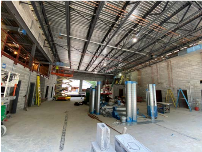
Overview of apparatus bay