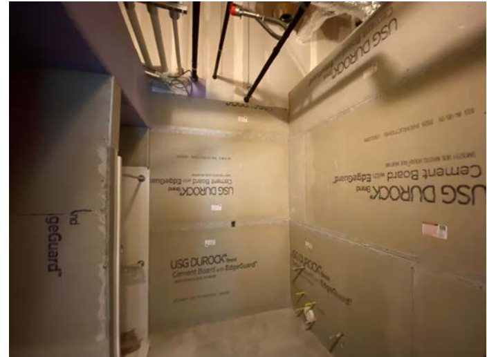
Tile backerboard installed in shower room