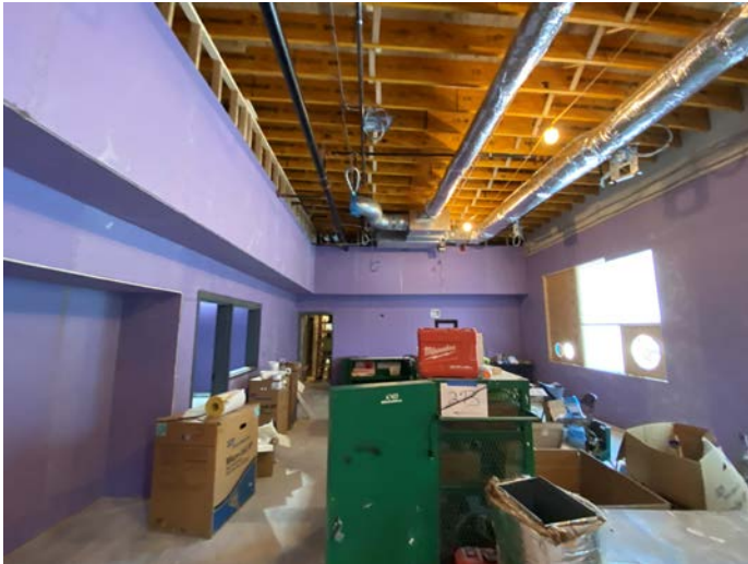
Drywall installed in living area