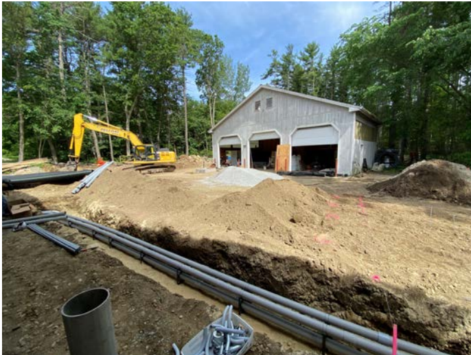
Installation of underground conduits for generator pad