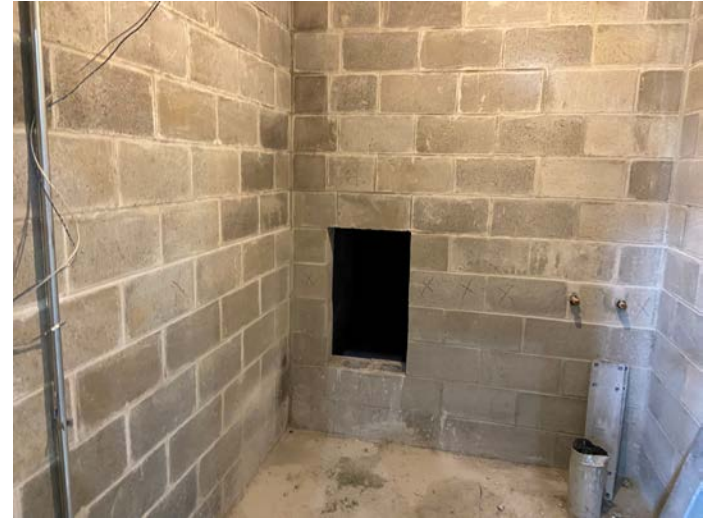
FP access panel cut out for access under mezzanine stairs