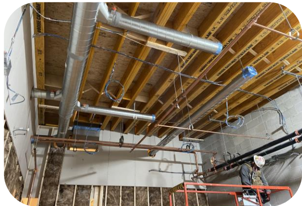
MEP in fitness room