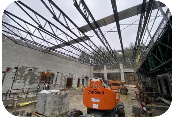
Steel roof joists in apparatus bay looking south from north side