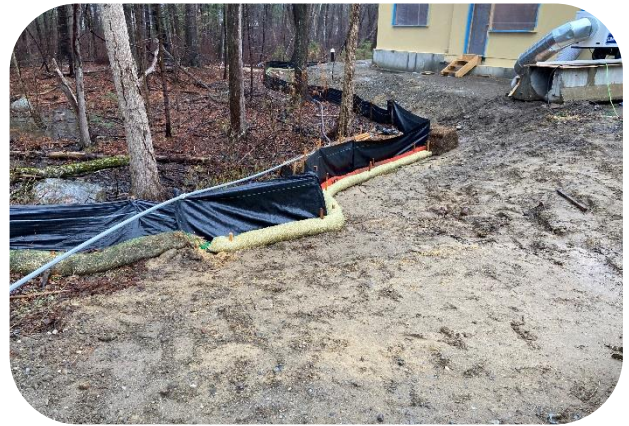
Corrected erosion and sediment control near north side of building