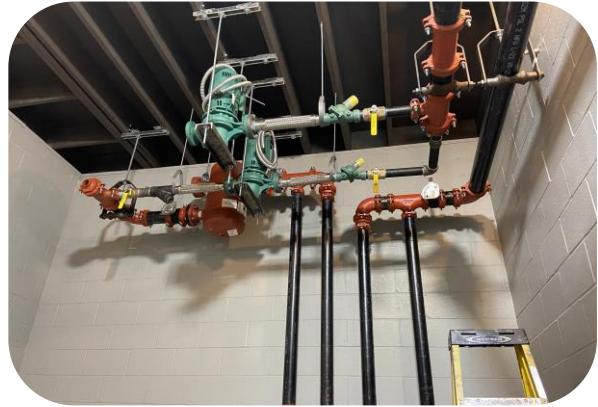
Geothermal mechanical in mechanical room