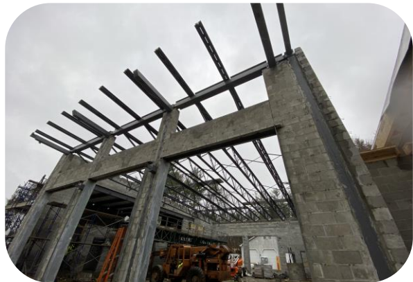
Steel roof joists in apparatus bay looking north from south side