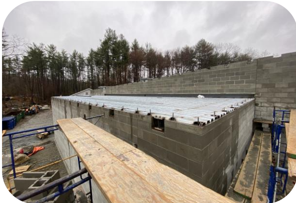
Metal roof decking on western mezzanine