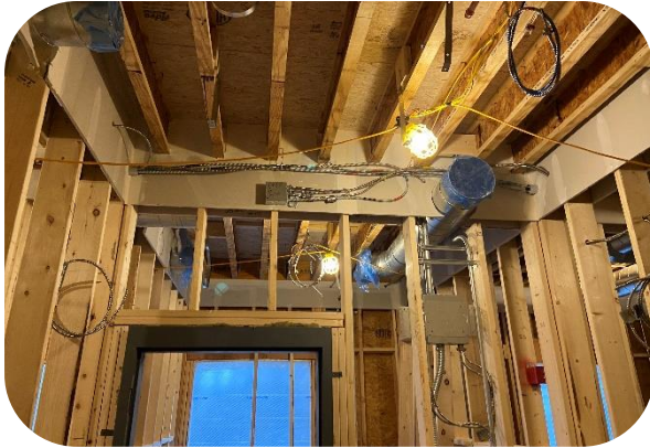
HVAC and electrical in bunk areas