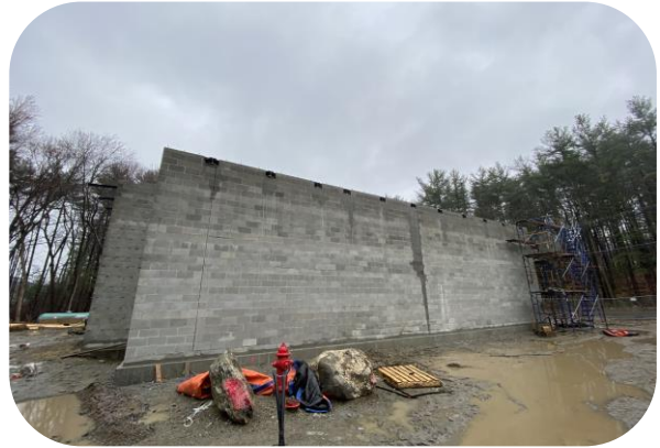
West side of building