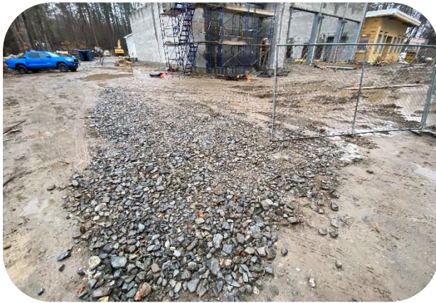
Corrected rip rap at southwest construction entrance