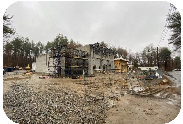
Overview of building from southwest side of site