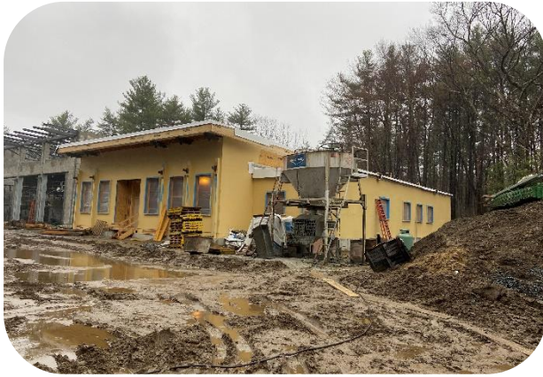
Overview of east side