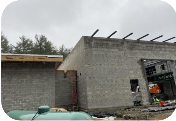
North side of apparatus bay