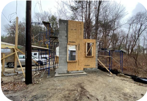
Mock up at job site trailer