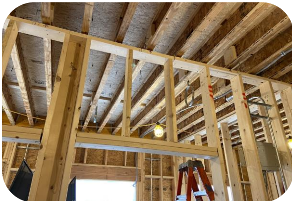
HVAC hanger installed in low roof area