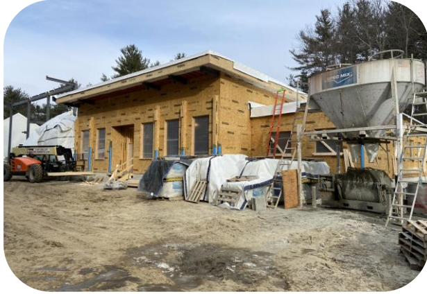
Overview of east side