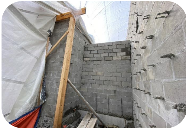
Northern exterior wall of electrical sub room between Line 6.5 and 5.