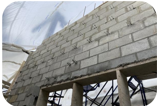
Line 5 masonry installation