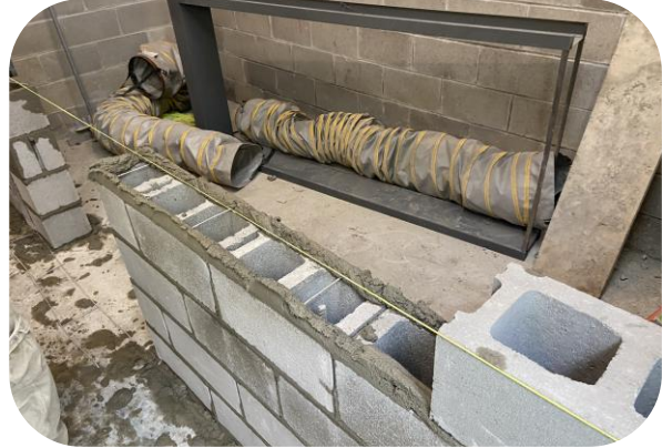
Typical construction of interior masonry wall