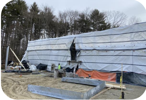
Masonry apparatus bay door frame