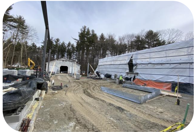
Overview of apparatus bay area