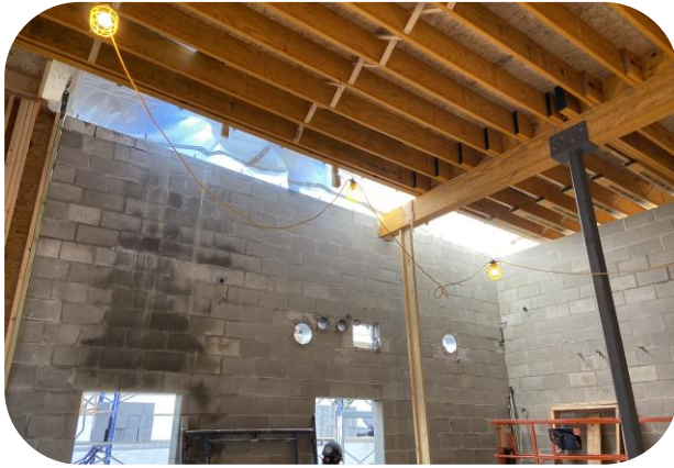
Masonry installed along Line 6.5 on south side of building