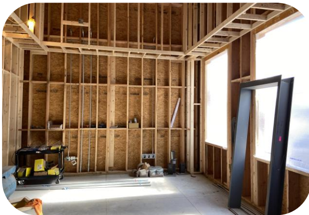
Soffits and time capsule area framed in conference room