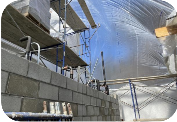
Plumbing and electrical rough-ins on east wall of dirty laundry room