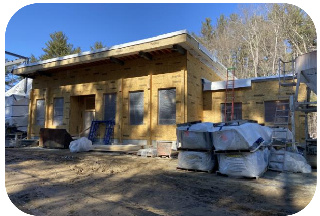
East side of building