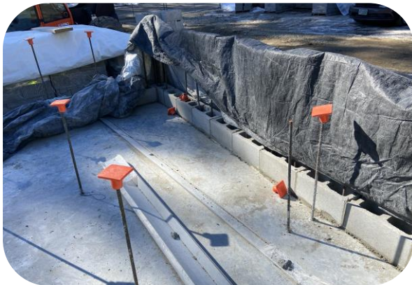
First course of masonry on west side