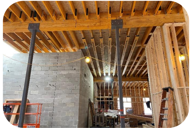
Masonry and interior wood framing installed in living area on east side of building