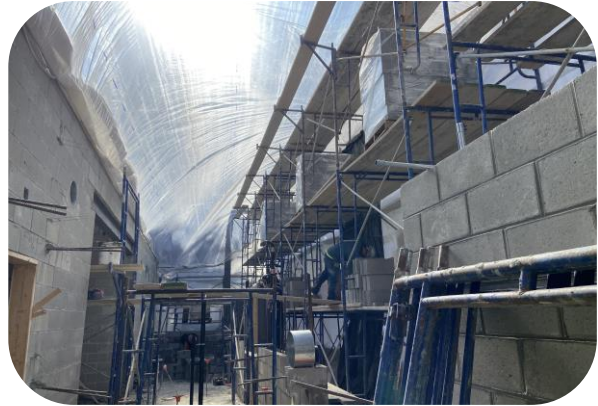
Masonry wall installation looking south from emergency electrical room