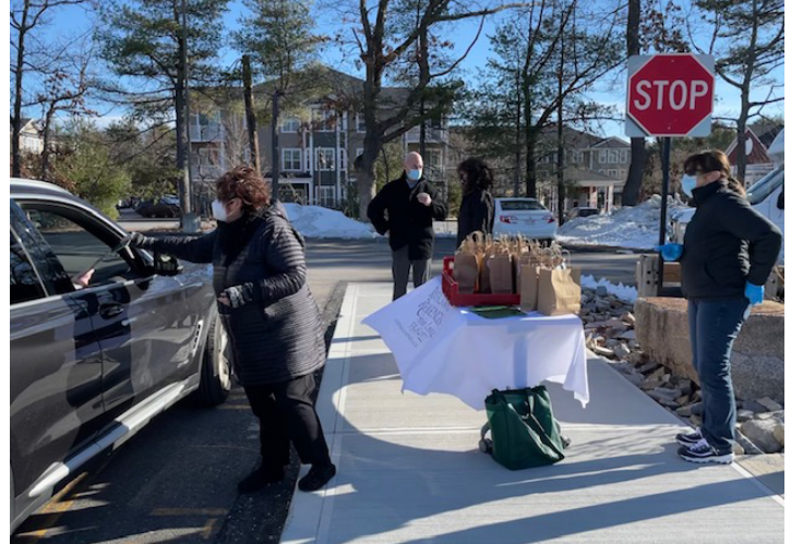
Council on Aging Volunteers and Employees participating in the January drive-through lunch at the Senior Center.

For more details on any of these programs and services, please view our February newsletter at www.actoncoa.com .