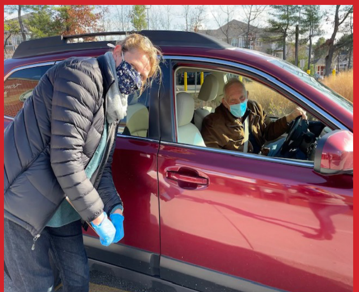
Thanksgiving Lunch Drive-through!