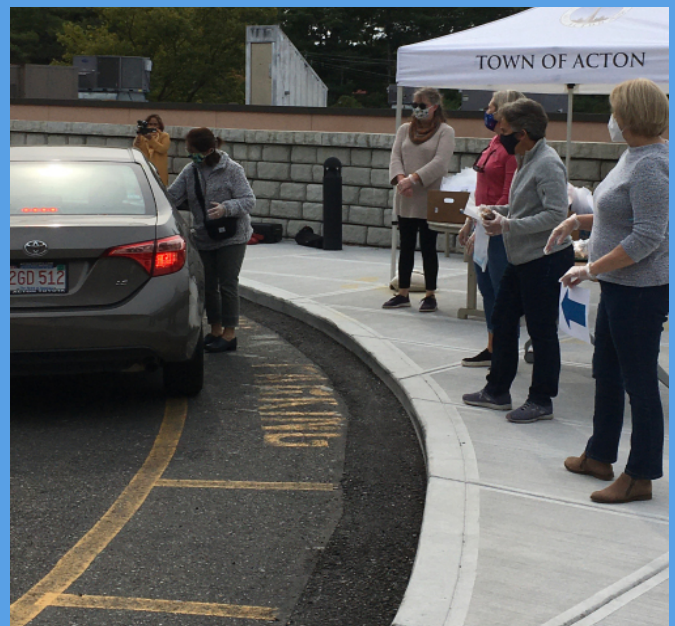
A-B United Way volunteers and Town staff at the COA's Drive-Thru Ice Cream Day!