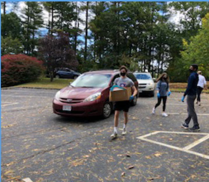
Seniors from ABRHS and Household Goods volunteers helping at the drive-thru donation event.

Thank you to the more than 100 seniors, and the student and Household Goods volunteers, who participated in our recent drive-through donation event for Household Goods. The van filled quickly, but thankfully Household Goods was able to send a truck which was also filled to the brim! We also appreciate the A-B United Way volunteers who helped with our drive-through ice cream day.