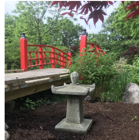
Arboretum China Trail

https://actoncoa.com/DocumentCenter/View/1058/Trail-Blazers-2020