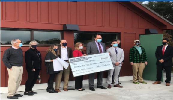
NARA Sports Pavilion Ribbon Cutting Ceremony. Presentation of $150,000 check from Acton's legislative delegation the accessible restroom project.