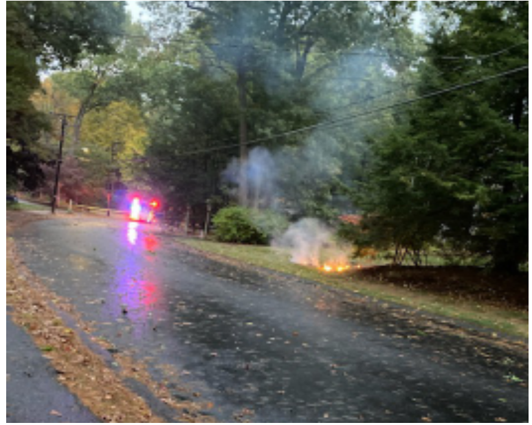
Storm damage in Acton, 2020 - Downed trees and power line.